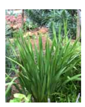
Watsonia sprouts, leaves, and flower.